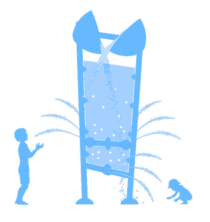
*The product shown in the image may differ from the actual product sold.