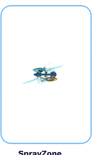
SprayZone 12 x 17.5 ft 366 x 533 cm